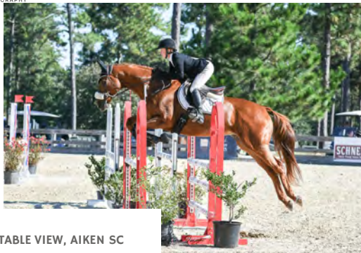
T.I.P. CHAMPIONSHIPS STABLE VIEW, AIKEN SC